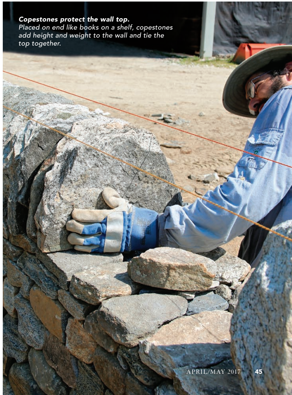
Copestones protect the wall top. Placed on end like books on a shelf, copestones add height and weight to the wall and tie the top together.