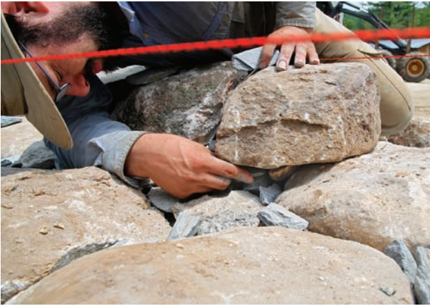
Pin from within. Pinning stones shim the face stones level and solidify their placement. Never pin from the face of the wall because it will just fall out over time.