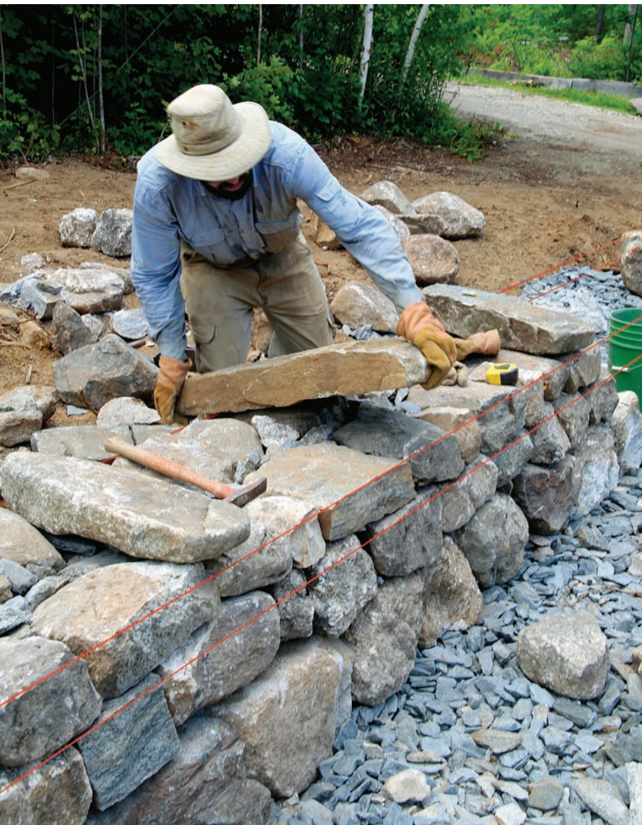
Tie the sides together. It's typical to let through-stones extend 1½ in. past the wall face to allow for flexibility in their length and for the wall to settle without slipping off them.

each side of the wall, level with each other and just higher than the course you're laying.