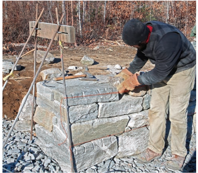
Build ends and corners like log cabins. Shaping is often needed to fit end stones. Alternate stones that span the wall width with long stones that tie back into each course.