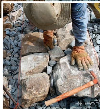
There will be voids. Face stones don't have to meet tightly inside the wall. Just pack the spaces full of hearding stones.