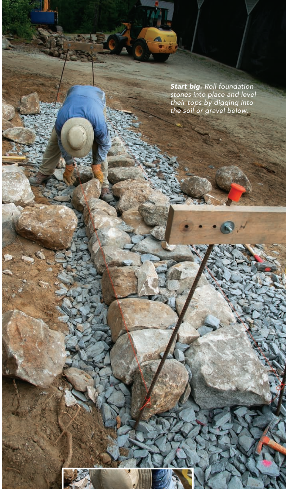
Start big. Roll foundation stones into place and level their tops by digging into the soil or gravel below.

Completing shorter sections of wall at a time is more efficient. Step back the ends of each section so the next section of wall ties into the area you've just finished. Define these sections by setting up sturdy batter frames 5 ft. to 20 ft. apart. String is used as a guide to keep walls straight and level or parallel to the ground. Tie strings to the inside edge of the batter frames on